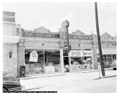
Above: Atlantas Gas Equipment Stores